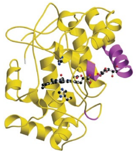
Structure of ascorbate peroxidase, to be used in this project.

The mechanisms by which cells control the supply and demand for heme and mobilise it to specific places are currently unknown. This lack of a generalised model for heme supply and demand is preventing, among other things, an understanding of how gene transcription is controlled in healthy cells or how certain pathways might be inappropriately activated in cells (including in disease).